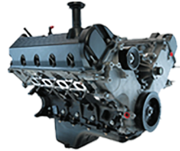
$300 INCENTIVE FORD GAS ENGINES

We are excited to announce an exclusive benefit for all fleets enrolled in the Ford Fleet Network program! The 2021 Ford Fleet Network Powertrain Private Offer is an immediate, off invoice discount on powertrains for all fleet customers enrolled in the Ford Fleet Network program.