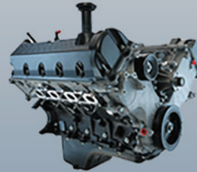
$300 INCENTIVE FORD GAS ENGINES

We are excited to announce an exclusive benefit for all fleets enrolled in the Ford Fleet Network program! The 2019 Ford Fleet Network Powertrain Private Offer is an immediate, off invoice discount on powertrains for all fleet customers enrolled in the Ford Fleet Network program.